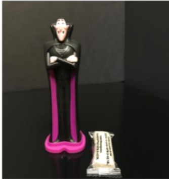
Fang Growin' Drac

Hotel Transylvania® 3 toys are coming to participating BURGER KING® restaurants! Recreate the adventures from the movie with these creative toys that showcase the popular characters from the movie!